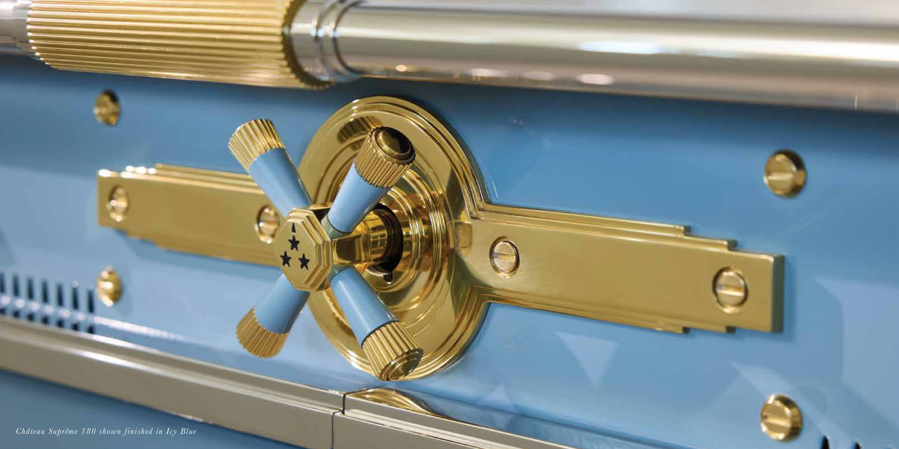
Château Suprême 180 shown finished in Icy Blue