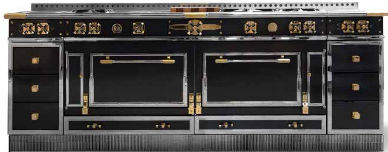
CHÂTEAU SUPRÊME 150