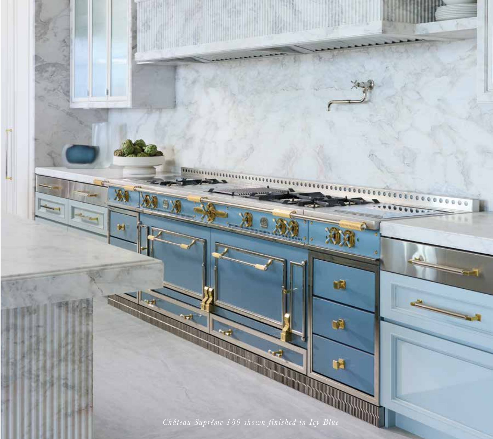
Château Suprême 180 shown finished in Icy Blue